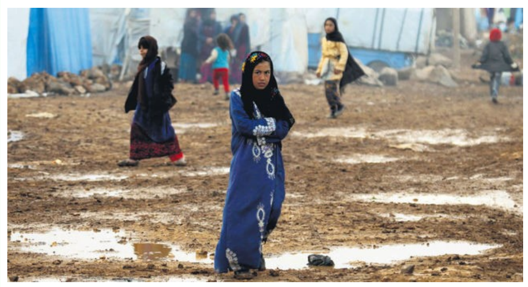
Displaced Syrian girl walking puddles of water amid a refugee camp in the Hama countryside, Syria.

Peace talks for Syria's future, which have, since the conflict started, been a main topic in multiple actors' foreign policy, gathered under the roof of the two major resolutions 2249 and 2254