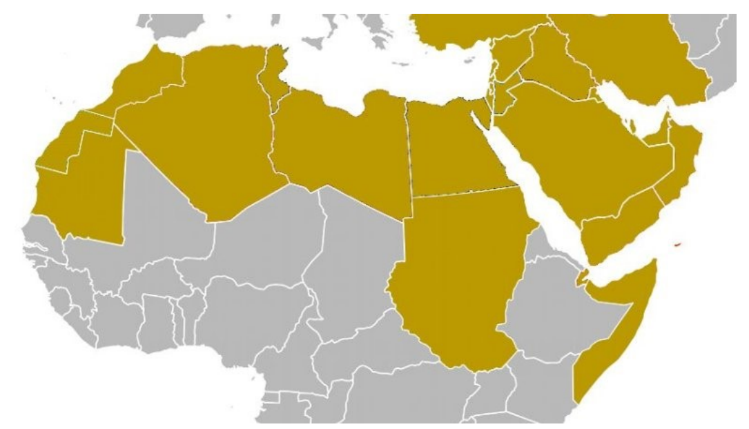
Middle East and North Africa (MENA)