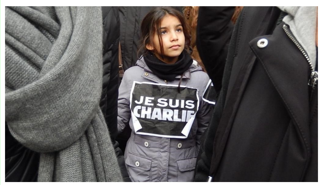
Une fillette arbore un «Je suis Charlie» lors du rassemblement du 11 janvier 2015 à Paris.

L'attentat contre Charlie Hebdo , il y a un an jour pour jour, a provoqué une onde de choc au sein des 64 000 établissements scolaires français. Les réactions ont été diverses parmi les élèves, allant de la compassion et du soutien jusqu'au rejet et à la colère. Chez les collégiens, c'est avant tout l'incompréhension qui a pris le dessus. Des professeurs d'établissements « sensibles » et des élèves de province se souviennent.